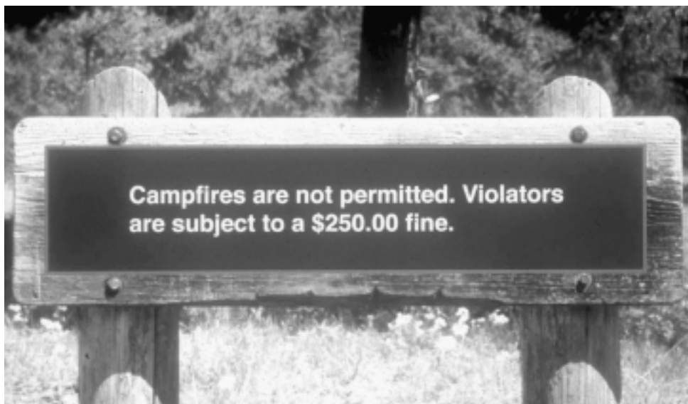
Figure 2—Campfire sanction sign seen by subjects in slide presentation.

of interpretive messages as an alternative to sanction messages for wilderness visitor management.