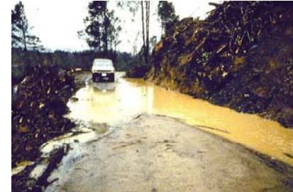
Figure 3: A plugged culvert can cause stream diversions with the potential for significant sediment delivery to streams.

The figure above shows the results of a prototype model in which the goal is to minimize the expected value of future erosion control costs. Expected future total erosion is assumed to be conditional on current surface erosion but not on current landslide erosion, i.e., landslides are assumed to be serially independent. At low levels of surface and landslide erosion, maintaining the status quo road is preferred since it avoids the lump-sum costs of road upgrade or removal. The boundary between maintaining the status quo road and removing the road slopes downward because, as surface erosion decreases, the expectation of future total erosion falls, making road removal relatively less attractive. That is, lower levels of current surface erosion require higher levels of landslide erosion to justify the expense of road removal. The boundary between maintaining the status quo road and upgrading to a higher road standard slopes upward, reflecting the relatively greater likelihood, as surface erosion increases, that the road will have to be removed later. That is, as the likelihood that a road will later be removed increases, it becomes progressively less desirable to pay the lump-sum costs of upgrading that road.