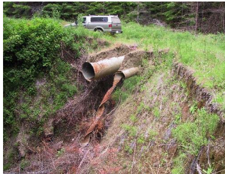
Figure 1: This road crossing failure on Road 630 delivered sediment directly to the stream network.

Road 630 on the Jackson Demonstration State Forest in Mendocino County, California, is an unused logging road. A recent inventory of erosion potential on the road suggests that both mass wasting (landslides or stream crossing failures) and chronic surface erosion are likely to deliver significant volumes of sediments to nearby Caspar Creek. Forest managers face the question of how to achieve cost-effective reduction of sediment delivery from this road—in particular whether to maintain the road as it is, to upgrade the road by removing culverts and sloping the road outward, or to remove the road entirely, including exporting unstable material.