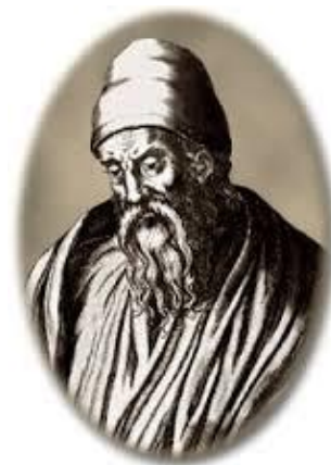
Euclid (325–265 BC)