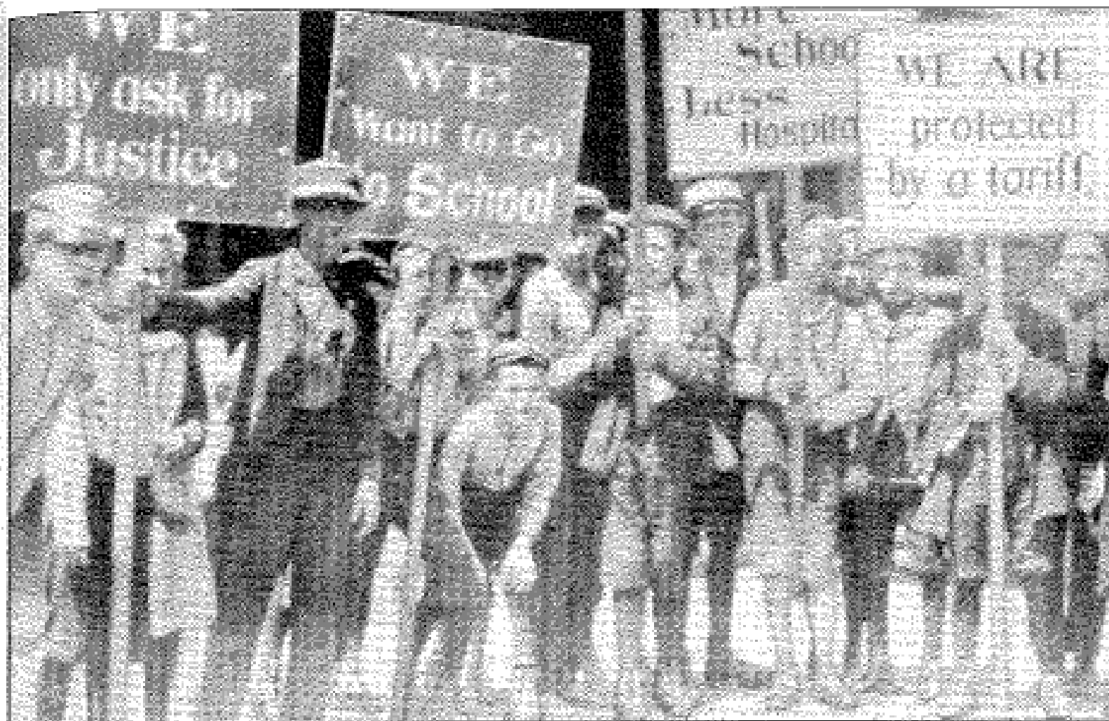
These pickets are helping to dramatize the case for labor's legislative agenda.