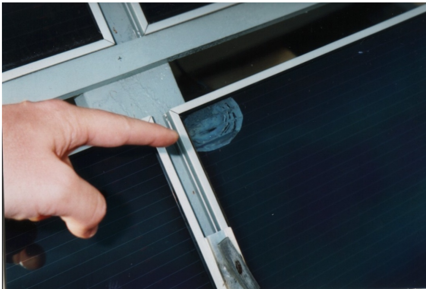
Figure 2. Water Intrusion Related Delamination in a Shenzhen Topray a-Si Solar Module. Response to Study Results by Kenyan Companies

In addition to low power output, we observed problems with module failure for both lines of Shenzhen Topray a-Si modules. In the case of the modules sold under the eSolar brand name, three of the four modules failed completely during their first few months on the test rack. One of the four modules sold under the SunLink brand name also failed during this time period. These failures appear to be caused by water intrusion that led to delamination of the active material of the a-Si modules. See Figure 2 for an illustration of this delamination.